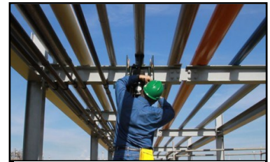
Quick and Easy Installation