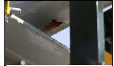
Corrosion at Pipe Support